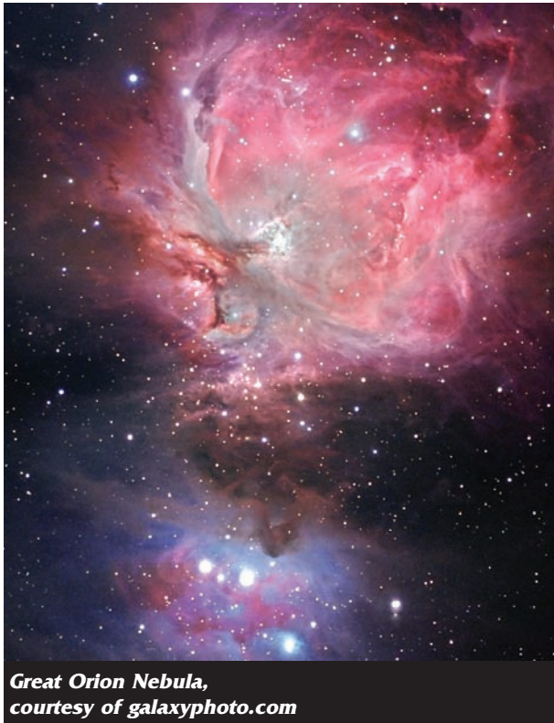
Great Orion Nebula

If you're interested in helping out at the observatory, becoming a supporting member of the GVO or donating a financial gift, email mbrooks@western.edu , or leave a message at 970-642-1111.