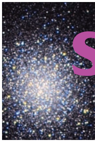
M13 Star Cluster

S eize the night and explore Earth's moon and the other planets in our Milky Way solar system; discover faraway galaxies, star clusters, nebulae and stars. Gunnison Valley